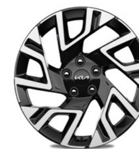
PHEV - 18" alloy