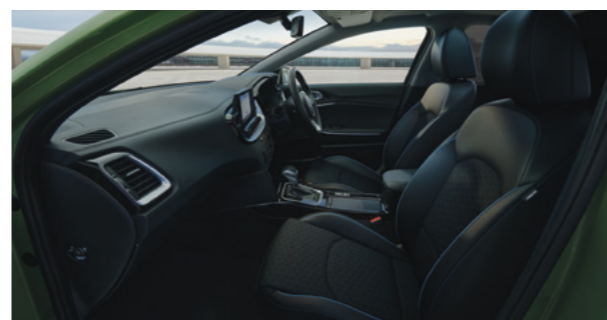
PHEV - Black Cloth & Artificial Leather Seats with Blue Stitching